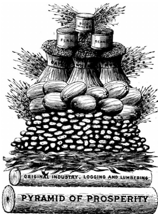
Figure 2. “Pyramid of Prosperity”