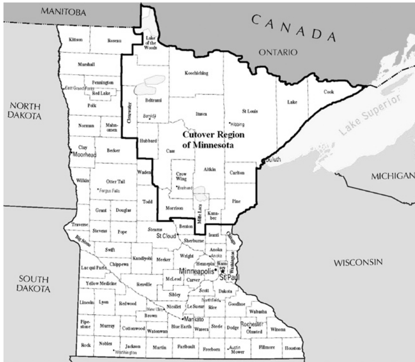
Figure 1. Map of Minnesota, with Cutover Region emphasized