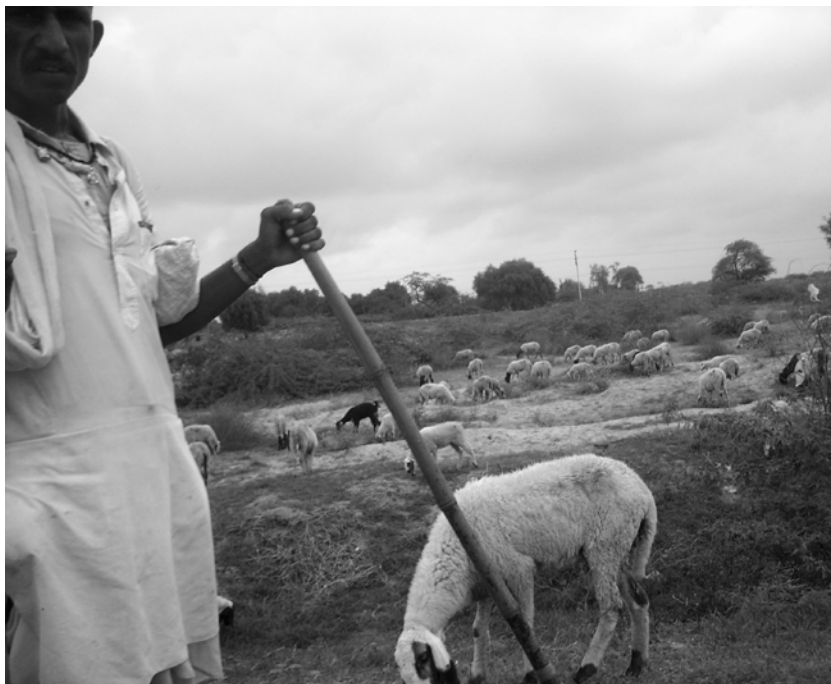
Figure 2. A Rebari with his flock of sheep