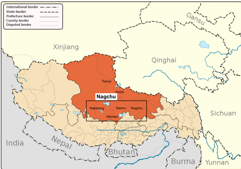
Figure 1. A rough estimate of the affected area.

In the early winter of 1828, the earth-rat year of the Tibetan calendar, there was a massive ‘snow disaster’ ( gangs skyon ) due to heavy snowfall in the central Tibetan plateau that severely affected the nomads of Nagchu and neighbouring communities including Namtso and Namru.