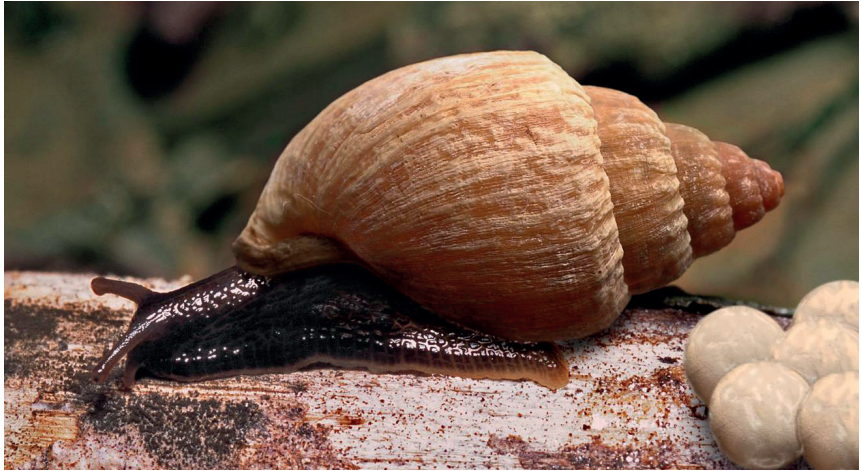
Figure 1: Chilonopsis nonpareil (Perry, 1811) [ Chilonopsis = Cochlogena sensu Darwin]. There can be little doubt that this medium sized snail had been extinct for many years prior to Darwin's observations of subfossil shells on St Helena in 1836. Nevertheless, some of the shells look as fresh as those of a living snail and they are found with what are likely to be their eggs. Using a shell and preserved eggs this image reconstruction shows what a living example might have looked like. Image prepared by Harold Taylor.

(2015) includes 832 species listed as extinct since 1600 and there are regular calls for more research into establishing detailed information for current extinction levels (Hayward, 2009). Although it is widely recognised that the level of evidence and how it is interpreted vary enormously (Regan et al., 2005), efforts continue to be made to refine and justify hard data. Several commendable and critical studies have attempted to establish reliable, evidence-based assessments of land snail extinctions (Lydeard et al., 2004; Régnier et al., 2009, Régnier et al., 2015). They come up with alarming figures but we should be mindful of Darwin's observation that extinctions of land snails are a visible example of a multitude of other extinctions that do not leave shells as a record of their passing. The 394 insect species recorded as being extinct by the IUCN Red List of Threatened Species bears absolutely no relation to reality (Hochkirch, 2016) and is meaningless. It might seem reasonable to ask, as these researchers do, what detailed evidence is available for current extinction levels. But is this missing the point? Firm figures are often cited but I contend that very few invertebrate risk status evaluations