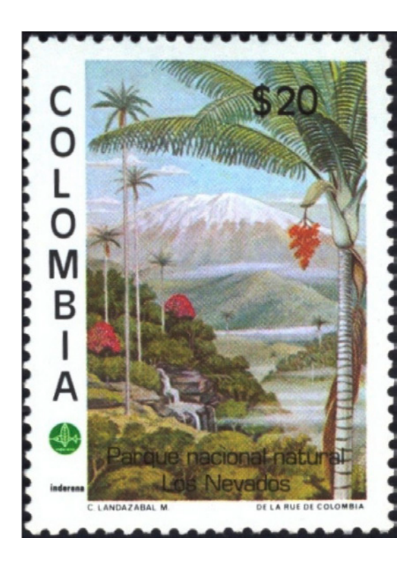
FIGURE 5. Wax palm portrayed in a 1981 postage stamp.

Also in 1979, the Radio Newspaper El Clarín of Medellín warned about the danger of the wax palm's extinction. Although the radio report does not mention the use of palm fronds in Holy Week bouquets as a cause of possible extinction, it does emphasise habitat transformation and especially that 'it has not been promoted enough, official entities do not investigate or promote it, nor do they reproduce it'. <sup>43</sup> Despite this concern for the national tree, it would only be in 1985, when the official declaration of the Quindío wax palm as a national symbol was made, that initial conservation guidelines would be established.