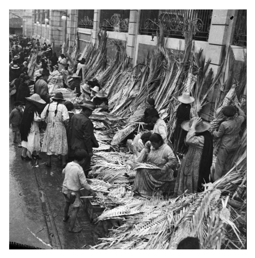
FIGURE 3. Venta de ramos [Sale of Palm Sunday Bouquets in Bogotá], 1945.

The impact on wax palm populations went unnoticed during the first half of the twentieth century, when environmental concerns were not part of the social discussion. However, this practice must have had obvious effects on palm populations. In contrast with trees and bushes, where trimming can lead to robust growth, the removal of photosynthetic structures (namely fronds) in palms slows the growth of young individuals, causing the shrinking of a population whose individuals require more