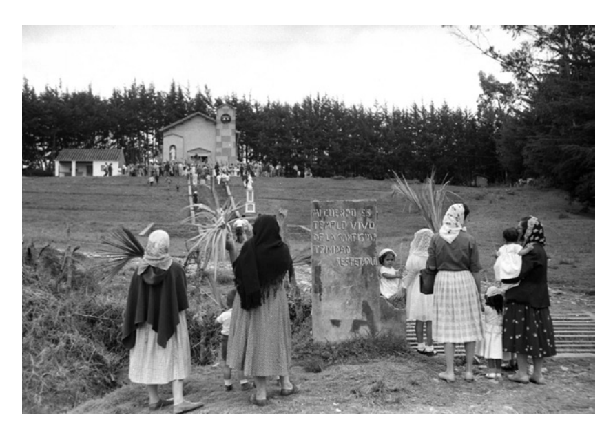
FIGURE 2. Gabriel Carvajal, Domingo de Ramos [Palm Sunday], 1973, 6x9 cm. Source : Courtesy of Archivo Fotográfico Biblioteca Pública Piloto, Medellín BPP-F-018-0102.

in the Palm Sunday celebration (Figure 2).<sup>24</sup> Nonetheless, to this day, the underlying reasons why the fronds of the wax palm were turned into a religious object are still not clear.