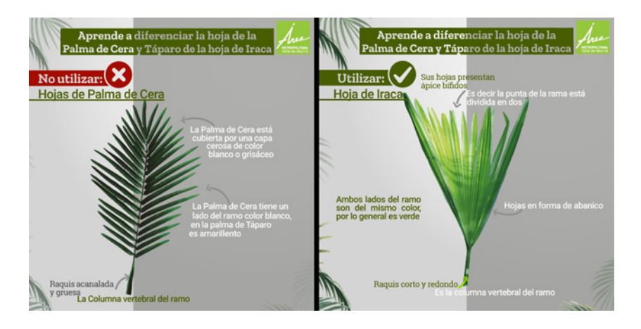
FIGURE 7. Posters designed to teach the differences between wax palm fronds and iraca leaves

to combat this botanical illiteracy. In doing so, they aimed to educate potentially informed parishioners to buy the correct bouquet for the religious celebrations of Holy Week (Figure 7).