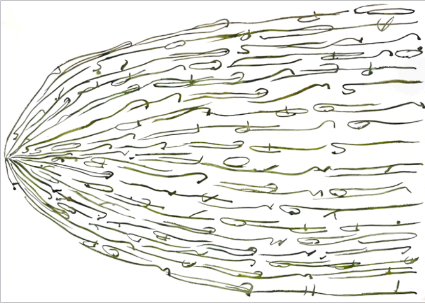
Papyrus boat, Cyperus papyrus , Watercolour on paper, 2023, 114x169 cm

A vessel of visions Made for you to return Home Your choice still remains