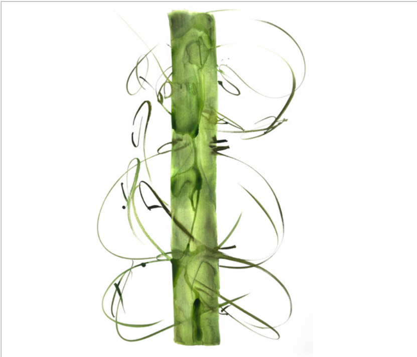
Religar Nicotiana tabacum & Nicotiana rustica , Watercolour on paper, 2023, 75x110 cm

Everything that you hurt Troubles your mind Will be blown away For when comes the time Land heals herself With the medicine She grows