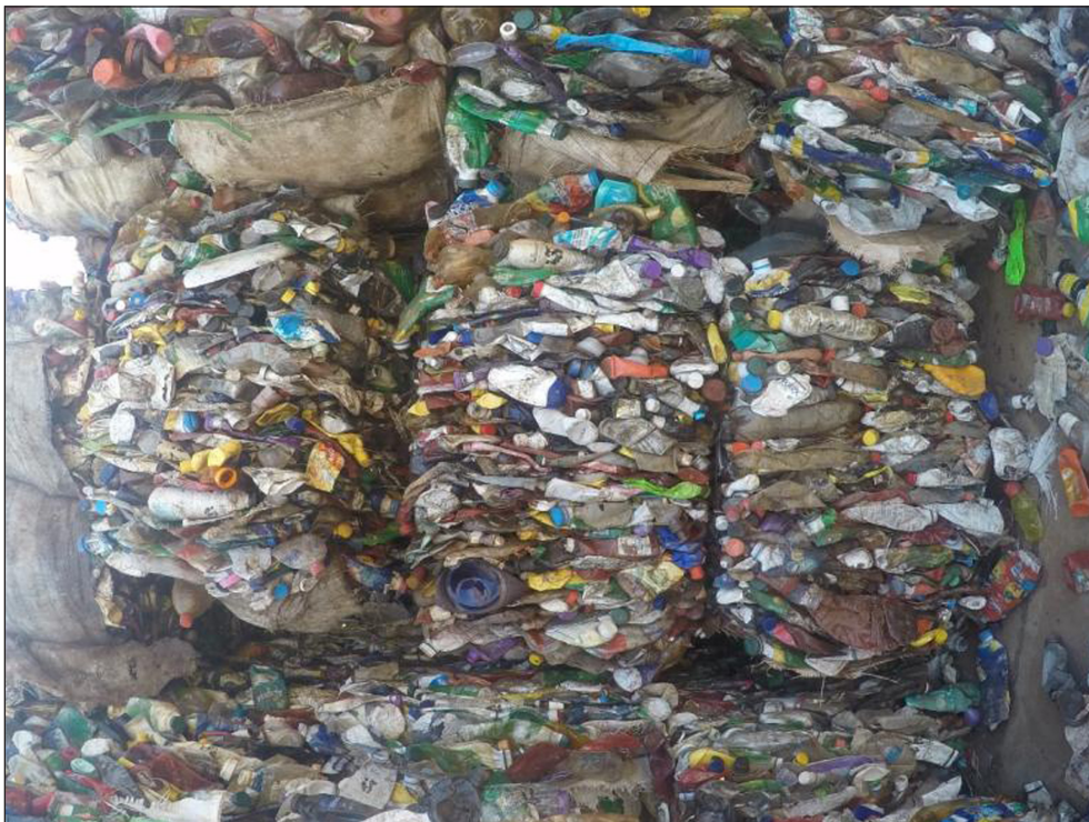
Figure 2: Bale of 'rubbish PET' at Recicle a Vida.

their product can be severely impaired undermining its competitiveness.