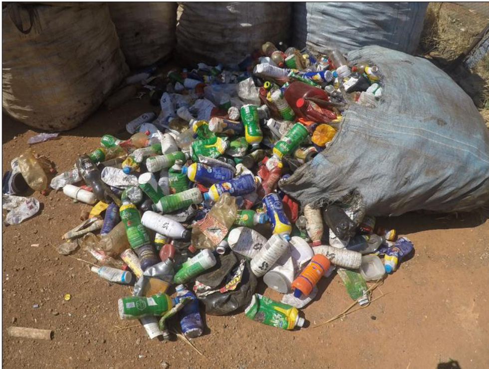
Figure 1: Torn sack of 'rubbish PET' at Recicle a Vida.