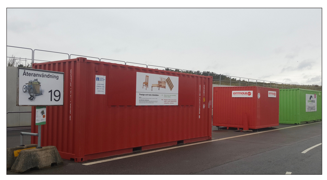
Figure 3: Drop-off point for donations at a municipal recycling station.

before they were ready to be removed to the representational outside (2004: 169, cf. McCracken 1986).