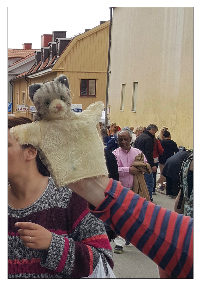
Figure 2: Man playing with a cat puppet bought at flea market.