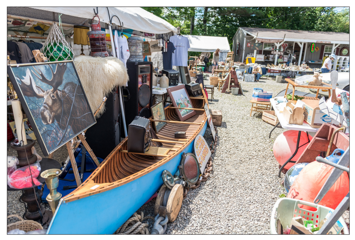
Figure 1: Signs of Maine's vibrant reuse economy are hard to miss.

range of exchanges, from free take-it shops at waste transfer stations to architectural salvage, high-end antique stores, flea markets, community sharing initiatives, and web-mediated peer-to-peer sales. Isenhour, Crawley and colleagues have also documented the strong continuity of Maine's reuse economy relative to other states, through periods of economic expansion and decline, using spatial analysis of county level employment and establishment data (Isenhour et al. 2017).