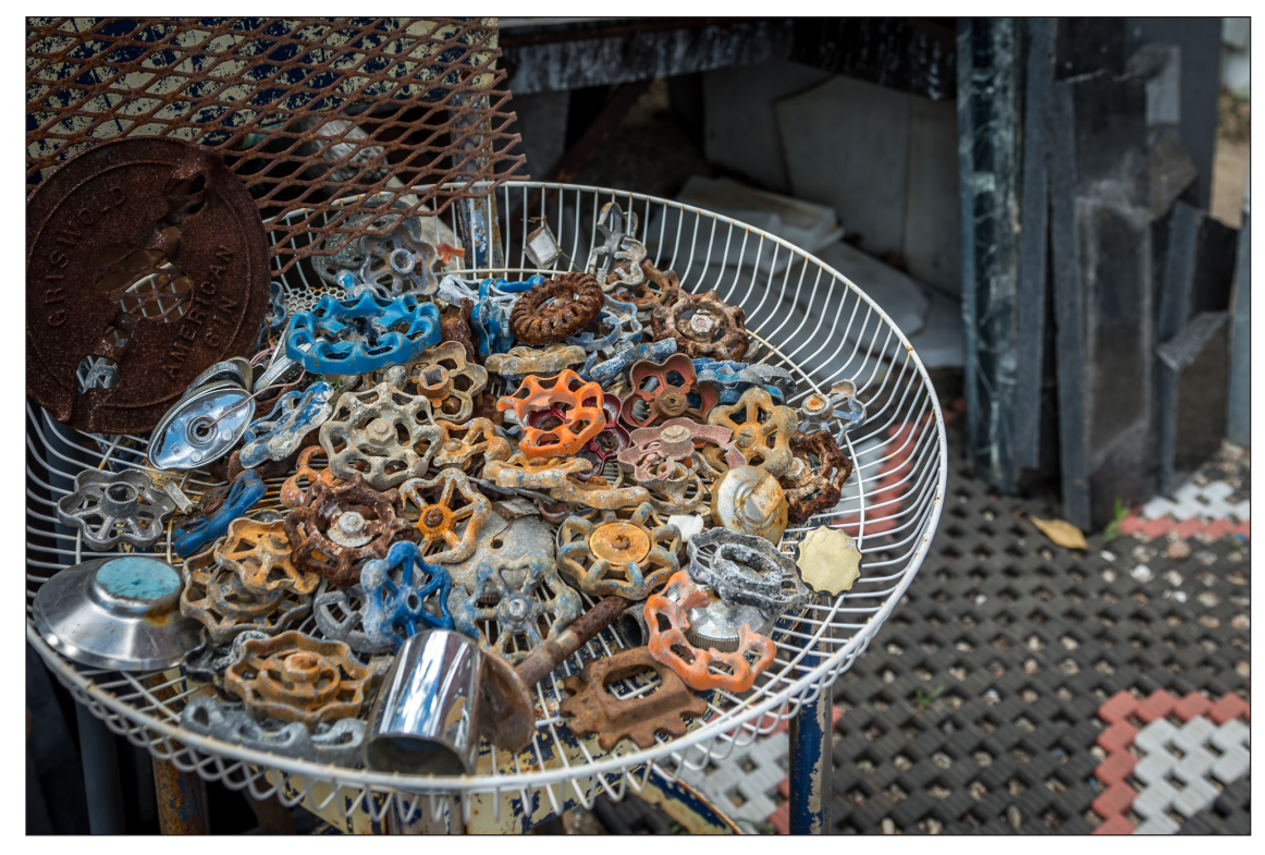
Figure 3: Salvaging value from the abandoned.

Indeed, while these perspectives on reuse add nuance and complexity, we argue that they also provide useful insight for those working to encourage reuse in other locales. For example, even if many Mainers' support for second-hand markets can be explained, in part, by a history of marginalization and resistance to full market integration and preference for regional economic development, it is nonetheless a form of resistance to systems of production-consumption-disposal that are now understood to be environmentally damaging and economically irrational. Public polling suggests that these sentiments are found far beyond Maine (New Dream 2014) and a growing number of projects centered on sharing, collaborative consumption, and reuse demonstrate a growing concern not only with environmental issues, but also with eroding local economies in an era of Walmart, Amazon and other new product corporate retailers that, on balance, funnel income out of local communities. Contrary to dominant ideology in the United States, economic and environmental interests are not mutually exclusive. Those interested in promoting reuse might do well, therefore, to think about how concern for regional economic resilience might also help to make a case for using what is already at hand to construct more resilient economic and environmental systems.